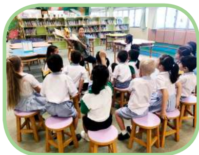
故事爸媽 Storytelling PaMa

We organize parents' storytelling workshops regularly to encourage parent-child reading. Through the workshops, parents can share their techniques and the joy of reading with their children.