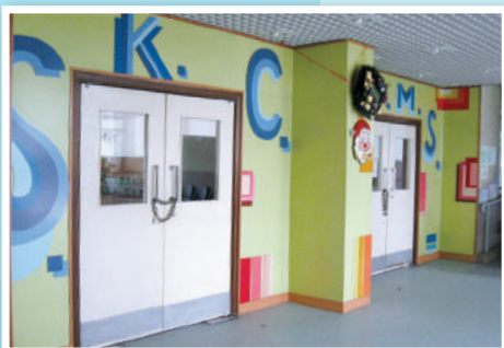
禮堂前 Outside the Hall