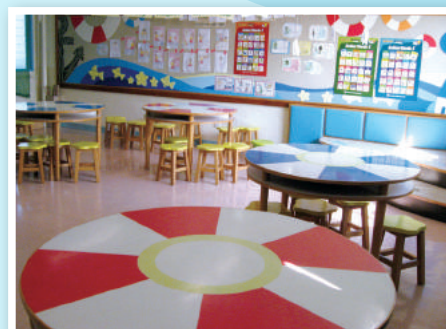
語言室 Language Room