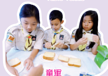
童軍 Cub Scouts