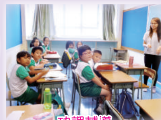
功課輔導 Homework Remedial Class