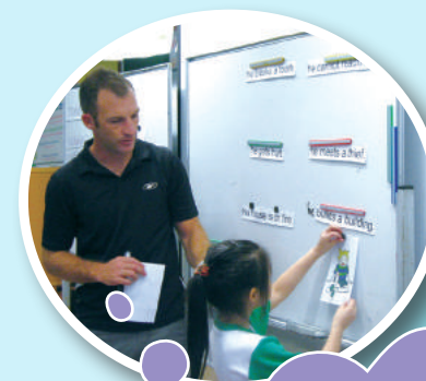
外籍英語教師計劃 Native-speaking English Teacher Scheme