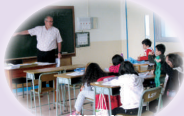
劍橋英語 Cambridge English Class