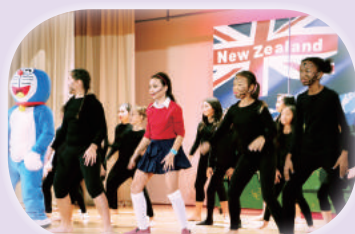
英語話劇 English Drama