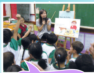
英語故事閱讀活動 Shared Reading Activities