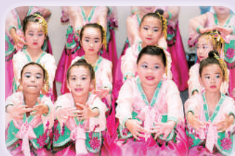
中國舞 Chinese Dance