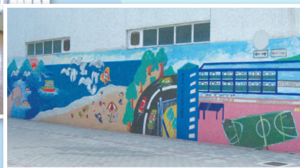
校園壁畫 Wall Decoration