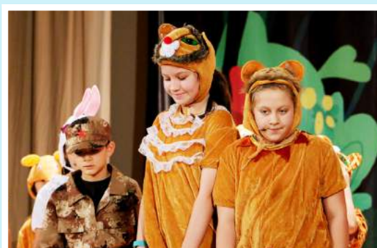
英語話劇 English Drama