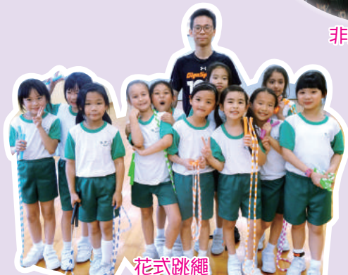
花式跳繩 Freestyle Rope Skipping