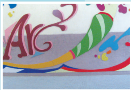
視覺室門外 Outside the Art Room