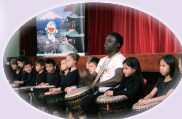
非洲鼓 Africa Drums