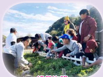
綠色先鋒 Green Volunteers