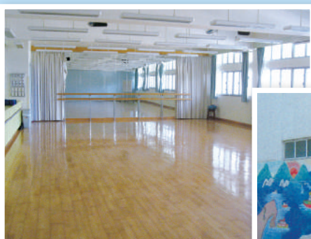
學生活動室 Student Activity Room