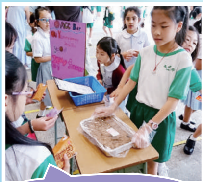
P4-6 Project-based Learning Programme 小四至小六專題學習