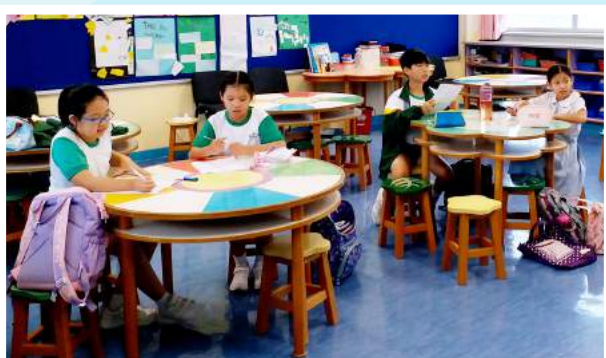
奧數培訓 Mathematical Olympiad Training