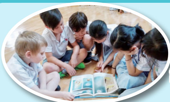
分享閱讀 Guided Reading