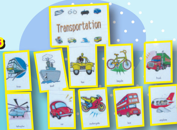
英語學習環境 Rich English Learning Environment