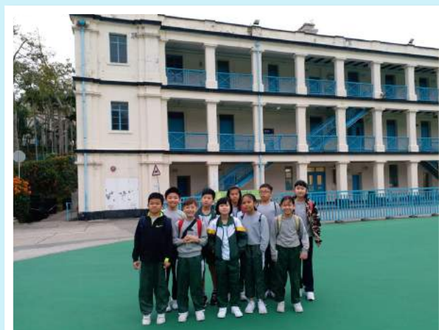
領袖培訓 Leadership Training