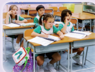
非華語學生中文班 Chinese Class for NCS students