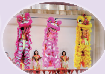
醒獅班 Lion Dance Class