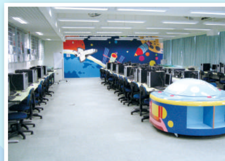
電腦室 Computer Room